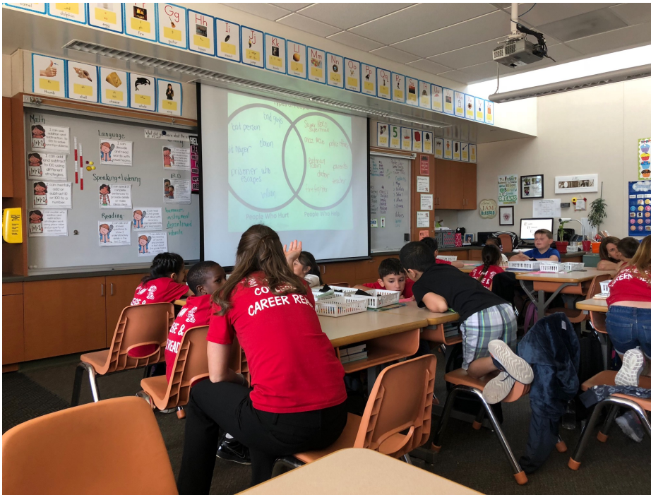
Fifth grade classroom filling out Venn diagram: “People who Help/People Who Hurt”