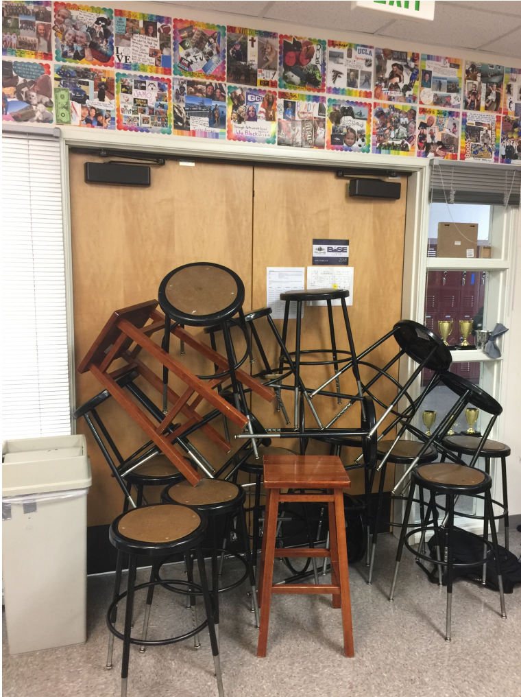
Barricade in Seventh Grade Classroom